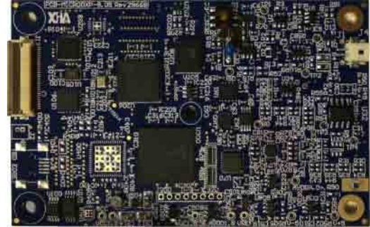
Actual size 2.125 x 3.375 inches